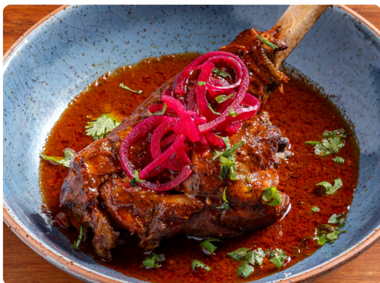
AUS LAMB SHANK "ASADO ABODO" THB 690 REFRIED BLACK BEANS, CILANTRO, PICKLES RED ONIONS, ADOBO GRAVY