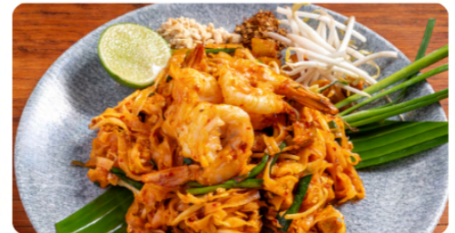
PAD THAI KUNG THB 290 RICE NOODLES, EGG, TIGER PRAWNS, PEANUTS, BEAN SPROUTS, TAMARIN SAUCE