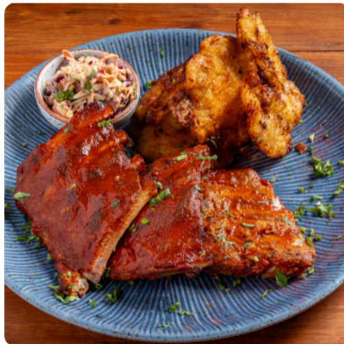
MEXICAN PORK RIBS THB 480 GARLIC, OLIVE OIL, ONION, CHIPOTLE SAUCE LIGHTLY SMOKED, SMASHED POTATOES, COLESLAW