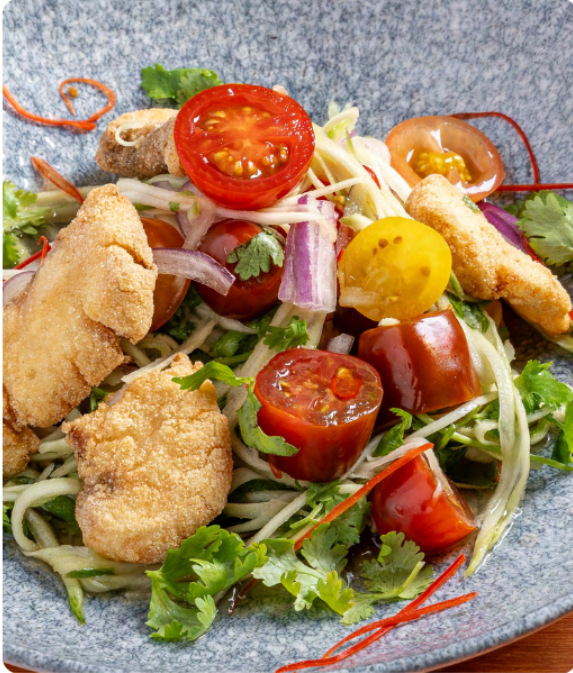
GREEN MANGO SALAD WITH DEEP FRIED SEABASS GREEN MANGO, CORIANDER, CHILI, LIME JUICE