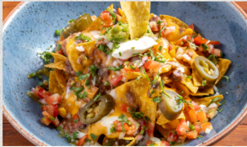
NACHOS THB 280 CORN CHIPS, REFRIED BEANS, MIXED CHEESES, SOUR CREAM, GUACAMOLE, PICO DE GALLO, JALAPEÑOS