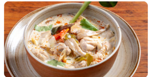
TOM KA KAI THB 240 LEMONGRASS, KAFFIR LIME, CHILI OIL, GALANGAL, CHICKEN, COCONUT MILK, SERVED WITH JASMINE RICE