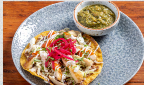
TOSTADA THB 220 GRILLED CHICKEN THIGH, RED ONION, MIX CABBAGE