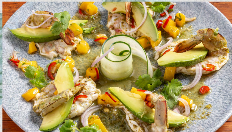
TIGER PRAWNS CEVICHE THB 320 MARINATED WITH JALAPEÑOS, AVOCADO, RED ONION, FRESH LIME JUICE