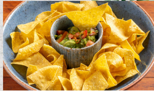
GUACAMOLE AND CHIPS THB 220 TORTILLA CORN CHIPS, HOMEMADE GUACAMOLE