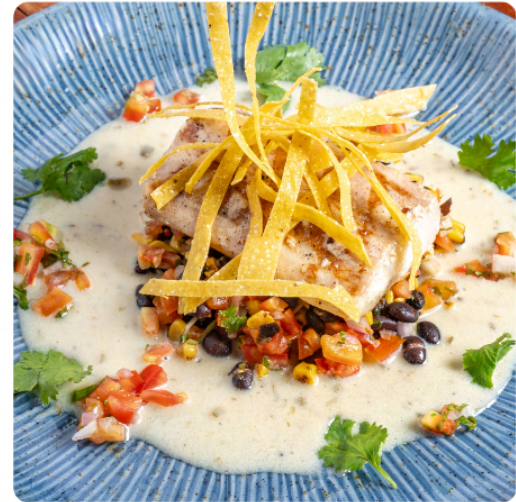
KING FISH TEQUILA CREAM SAUCE THB 440 LIME JUICE, TEQUILA CREAM SAUCE, JALAPEÑOS, CORIANDER, SWEET CORN, BLACK BEANS, BELL PEPPER