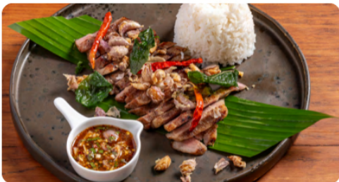
BBQ PORK NECK THB 320 MARINATED IN THAI SAUCE AND HERBS