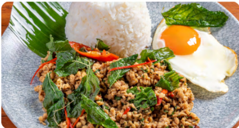
STIR FRIED CHICKEN WITH THAI BASIL THB 270 GARLIC, CHILI, THAI BASIL, OYSTER SAUCE