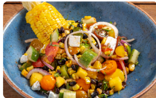
MEXICAN SALAD THB 270 MANGO, AVOCADO, FETA CHEESE, SWEET CORN, BLACK BEANS, TOMATO, RED ONION, CORIANDER, GREEN SAUCE, CITRUS DRESSING