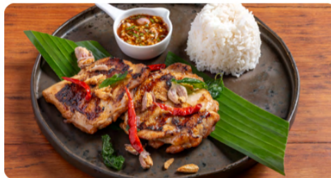
BBQ CHICKEN THB 320 MARINATED IN THAI SAUCE AND HERBS