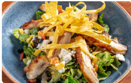
CORIANDER AND CITRUS CHICKEN SALAD THB 280 GRILLED CHICKEN TIGHS, FETA CHEESE, GUACAMOLE, LETTUCE, BLACK BEANS, CHARCOAL BABY CORN, TORTILLA STRIPS, CORIANDER, FRESH LIME, PICO DE GALLO, CITRUS CILANTRO DRESSING