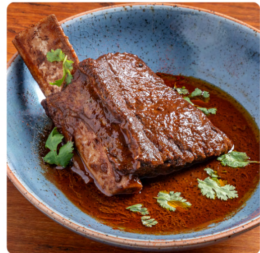
AUS ANGUS BEEF SHORT RIBS THB 890 CHILI CHIPOTLE ADOBO, TOMATO SAUCE, ONION, GARLIC, BEER, CILANTRO, ACHIOTE PASTE, SMASHED POTATOES