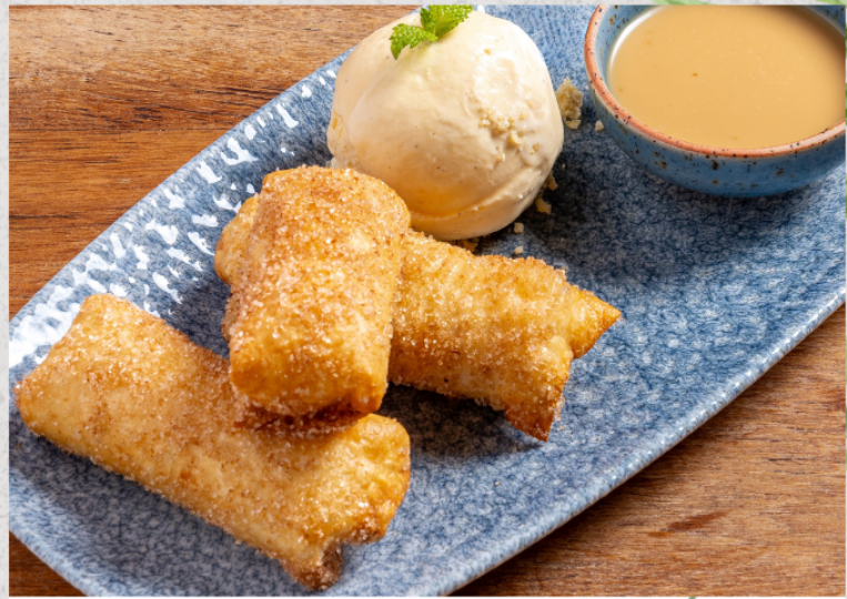
TEQUILA CHEESE CAKE "CHIMICHANGA"

FRIED PASTRY STICKS, CINNAMON, SUGAR, CHOCOLATE SAUCE, DULCE DE LECHE