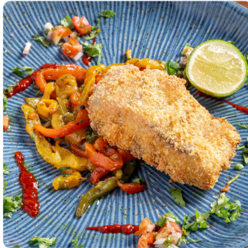
ROASTED BREADED SEABASS THB 380 BELL PEPPER, PICCO DE GALLO, TOMATO, CORIANDER, CITRUS, TEQUILA