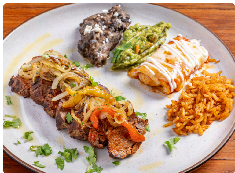
AUS WAGYU HANGER STEAK "TANPIQUEÑA" THB 890 REFRIED BEANS, MEXICAN RICE, GUACAMOLE, ENCHILADA