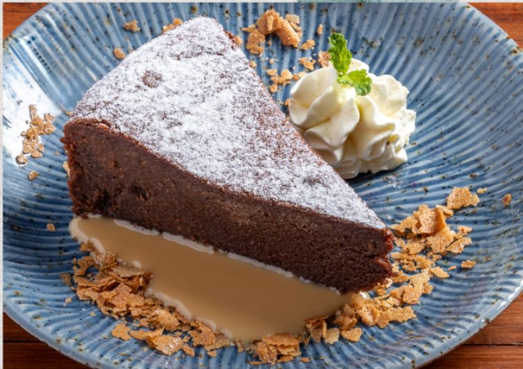
FLOURLESS CHOCOLATE CAKE

CREAM CHEESE, TEQUILA, FLOUR TORTILLA, SUGAR, CINNAMON, VANILLA ICE CREAM, WHIPPED CREAM, DULCE DE LECHE