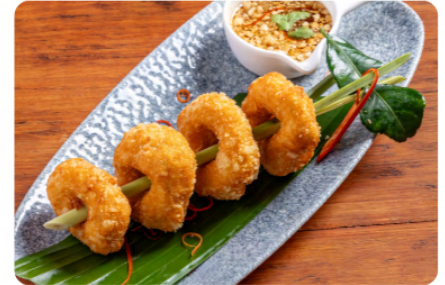
PRAWNS CAKE THB 250 SWEET CHILI SAUCE, LIME, CORIANDER