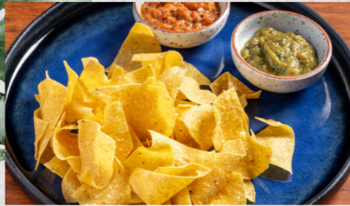
CHIPS AND SALSA THB 180 TORTILLA CORN CHIPS, GREEN SAUCE, HOT SALSA ROJA