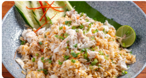
FRIED RICE WITH CRAB THB 380 CRAB MEAT, CARROT, ONION, SPRING ONION, FISH SAUCE, EGG, LIME JUICE