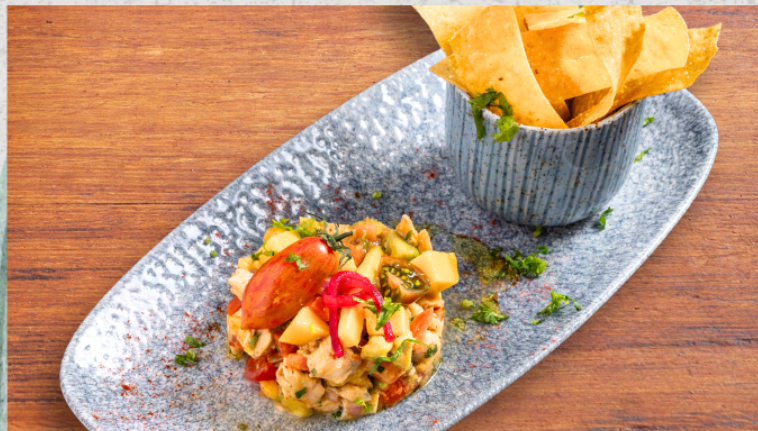
SEABASS CEVICHE THB 270 SEABASS FILLET, MANGO, SALSA, FRESH LIME JUICE, PICO DE GALLO, CORN CHIPS