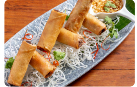
SPRING ROLL THB 220 SWEET CHILI SAUCE