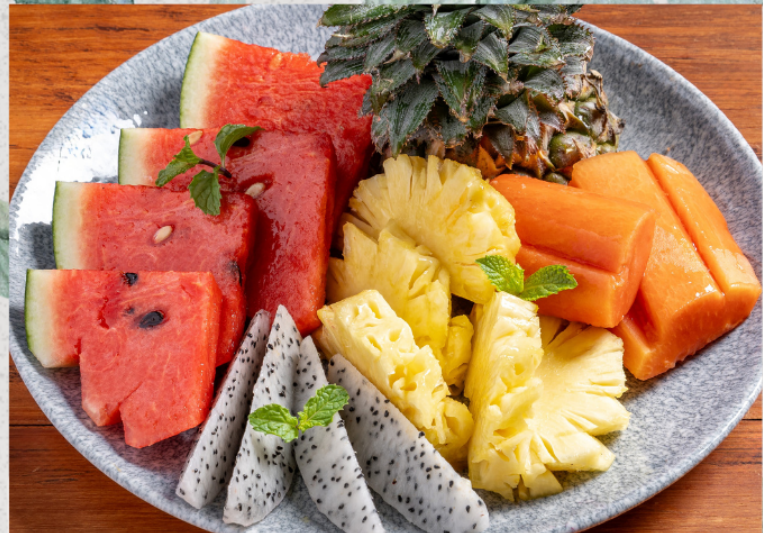
MIXED FRUITS PLATTER