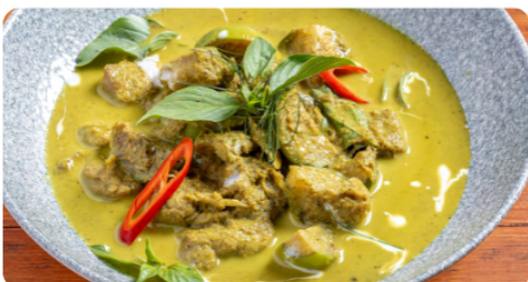
CHICKEN GREEN CURRY THB 280 COCONUT MILK, GREEN CURRY PASTE, EGGPLANT, SWEET CHILI, SERVED WITH JASMINE RICE