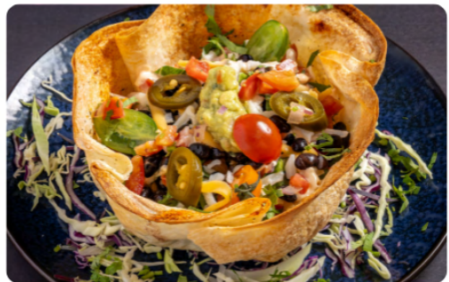
NACHO TACO BOWL SALAD THB 290 CRUNCHY TORTILLA BOWL, CHEDDAR, GUACAMOLE, BLACK BEANS, LETTUCE, JALAPEÑOS, SOUR CREAM, CHIPOLTE RANCH DRESSING