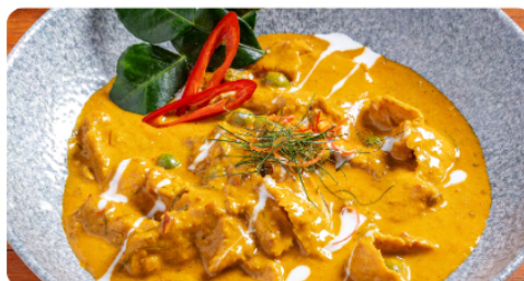
PANEANG MOO THB 290 RED CURRY PASTE, EGGPLANT, COCONUT CREAM, SERVED WITH JASMINE RICE