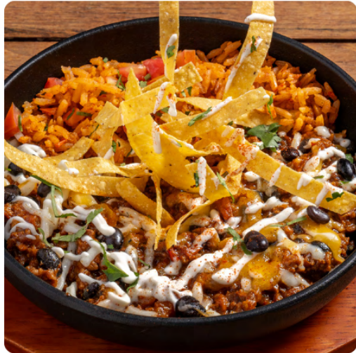
CHILLI CON CARNE THB 360 MINCED AUS BEEF, BLACK BEANS, RICE, MEXICAN SPICE