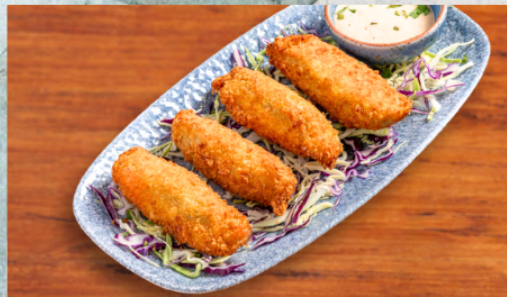
JALAPEÑOS POPPER THB 240 JALAPEÑO, MIXED CHEESES, BREAD CRUMBS, RANCH DRESSING