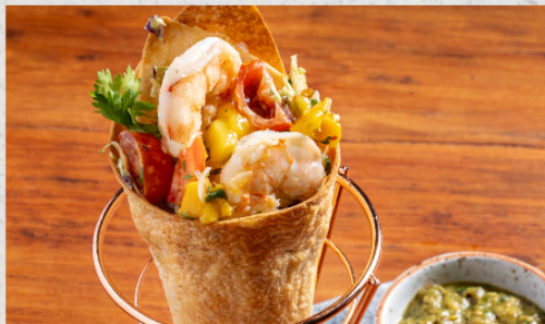
TIGER PRAWNS MEXICAN CORNET THB 280 MANGO, AVOCADO, TOMATO, CORIANDER, COLESLAW IN TORTILLA CORN CHIPS, GREEN SAUCE & HOT SALSA ROJA