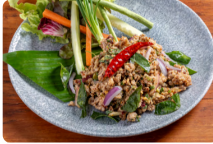
LAAB MOO THB 220 SHALLOT, CORIANDER, THAI ROASTED RICE POWDER, MINT