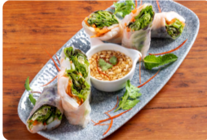
VIETNAMESE SPRING ROLL THB 240 PRAWNS, FRESH HERBS, LIME, CUCUMBER, CARROTS, MINT