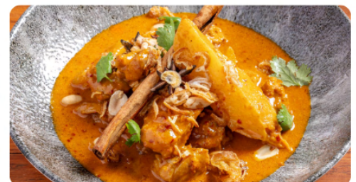
CHICKEN MASSAMAN THB 290 MASSAMAN CURRY, CINNAMON, POTATOES, CORIANDER, SERVED WITH JASMINE RICE